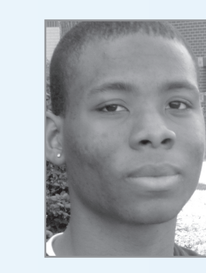
Charles White Valley Park High School